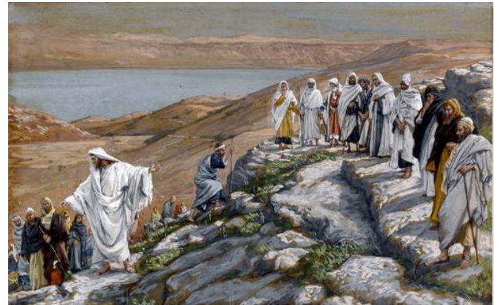
Christ Sends Out the Seventy-Two Disciples, James Tissot (1836-1902)