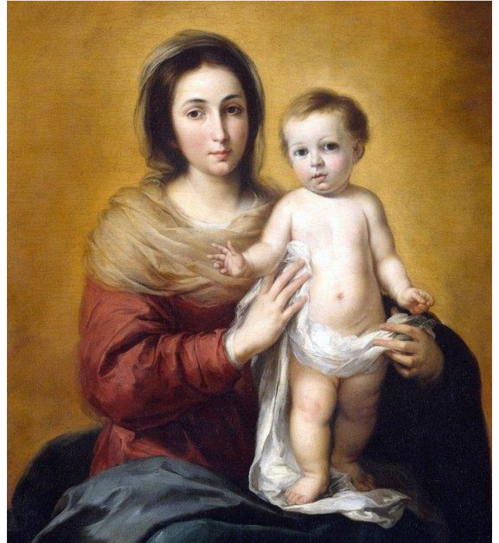
Madonna and Child, Bartolome Esteban Murillo

Baptisms & Marriages: Please contact the Parish Priest