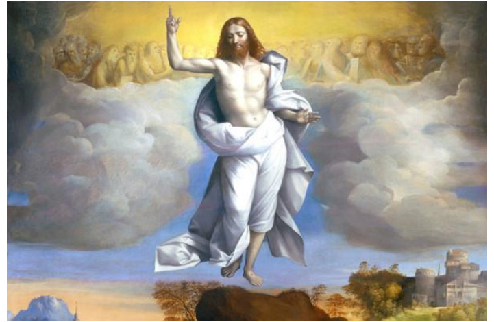
The Ascension of the Lord