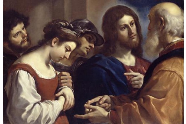
Jesus with the Woman Caught in Adultery, Guercino 1591-1666

Baptisms & Marriages: Please contact the Parish Priest