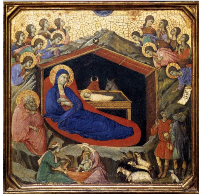
The Nativity, Duccio di Buoninsegna, c. 1255 - 1318

Baptisms & Marriages: Please contact the Parish Priest