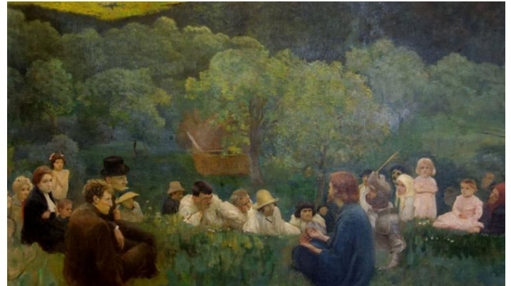
The Sermon on the Mount, Karoly Ferenczy 1896

Baptisms & Marriages: Please contact the Parish Priest