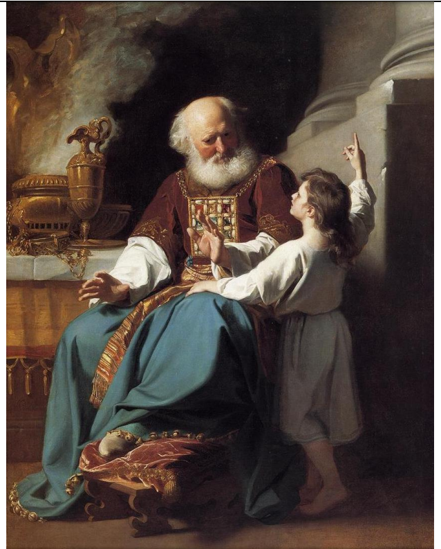
Eli and Samuel, John Singleton Copley, 1780