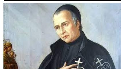
Memorial of Blessed Dominic of the Mother of God (Thursday 26th August)